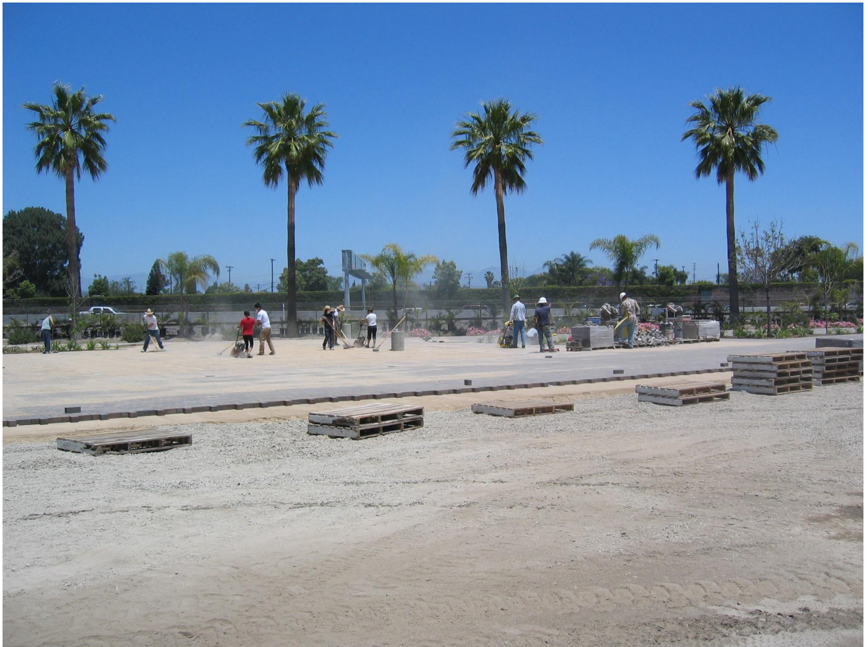
After the pavers are laid, volunteering workers are sand-filling the gap and vibration-compacting the surface.