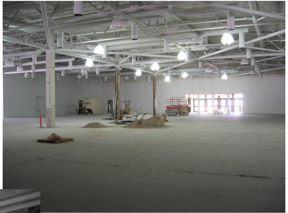
What we see here is about \frac{1}{4} of the meeting space. The brother indicates that the building is permitted for 5,000 seating capacity. However, it will still have plenty room left with 5,000 seats.