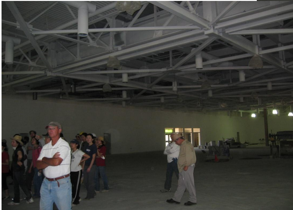
This project involves very complicate structural work. You can see one of those from this photo. Some of the existing columns has been cut and removed at the bottom and supported with new steel beams in order to achieve the wide open spans.