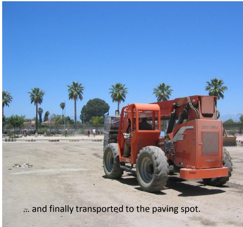
... and finally transported to the paving spot.