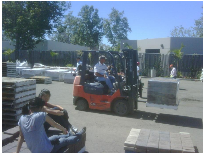
... moved to the staging location ...