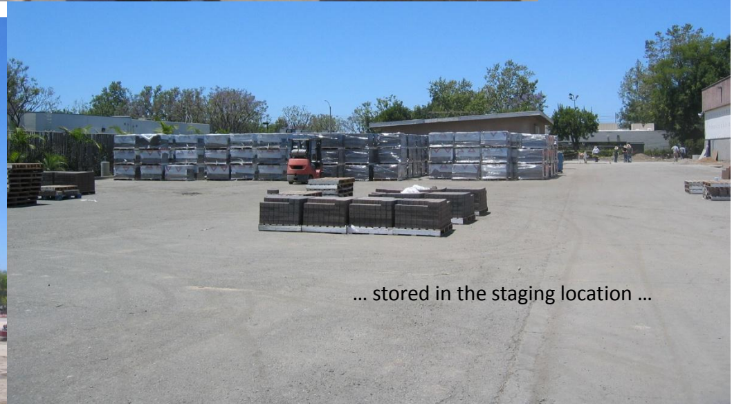
... stored in the staging location ...

Each pallet has 384 pavers. With all the teams of L.A. and South Bay together on that weekend, we had got approximately 140 pallets completed.