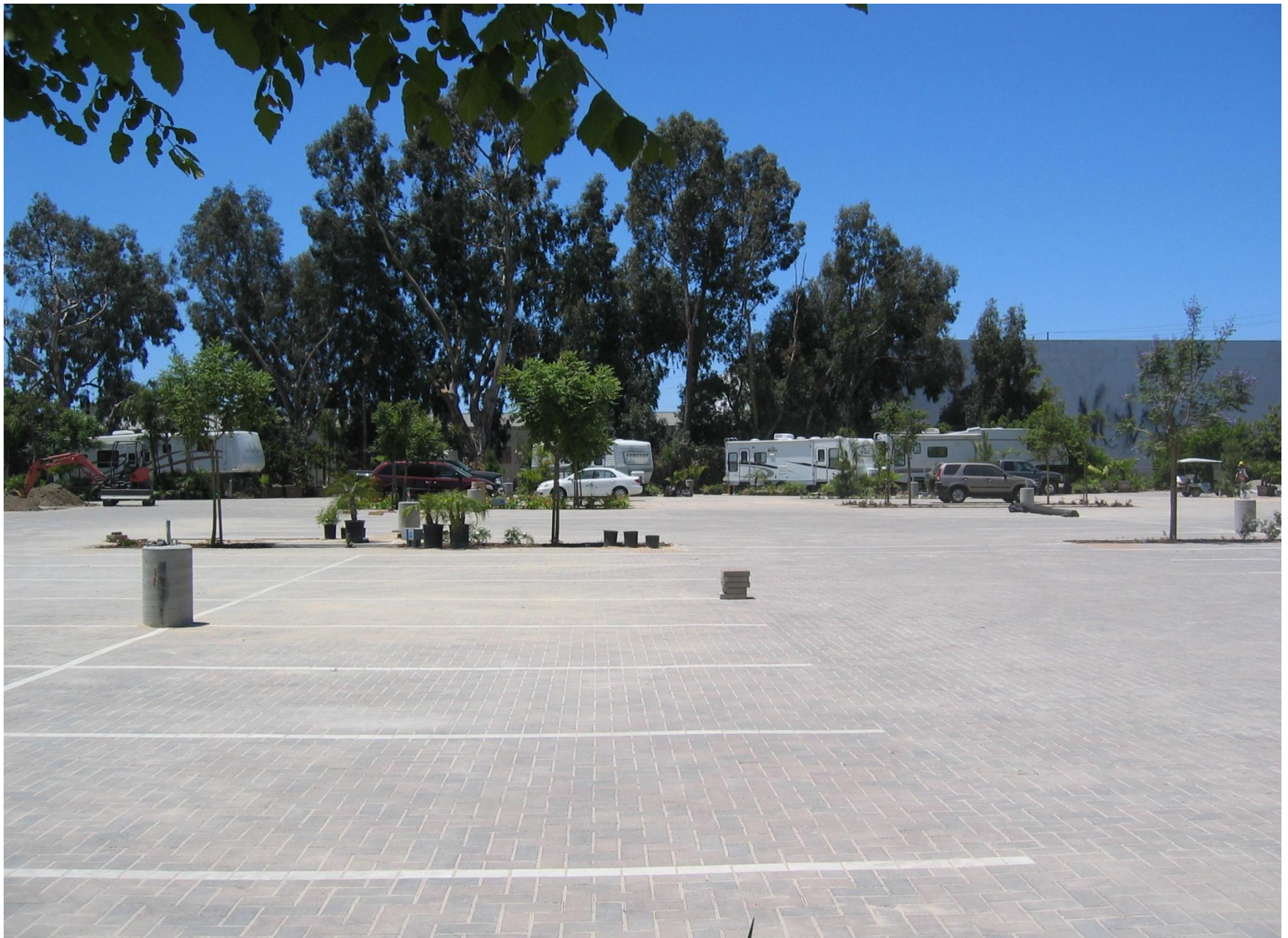
Northwest corner of the finished parking lot. According to the serving brother, the parking lot is scheduled to be completed in September 2010. During the week of Spring break, the students from Berkeley had laid 131 pallets of these pavers on the ground.