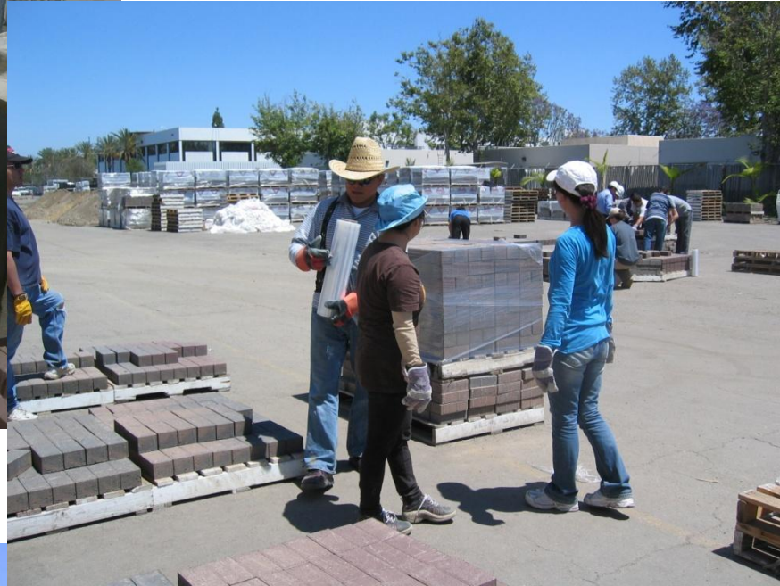
Saints from Campbell and Santa Clara were assigned working with saints from L.A. to “mix” the pavers.