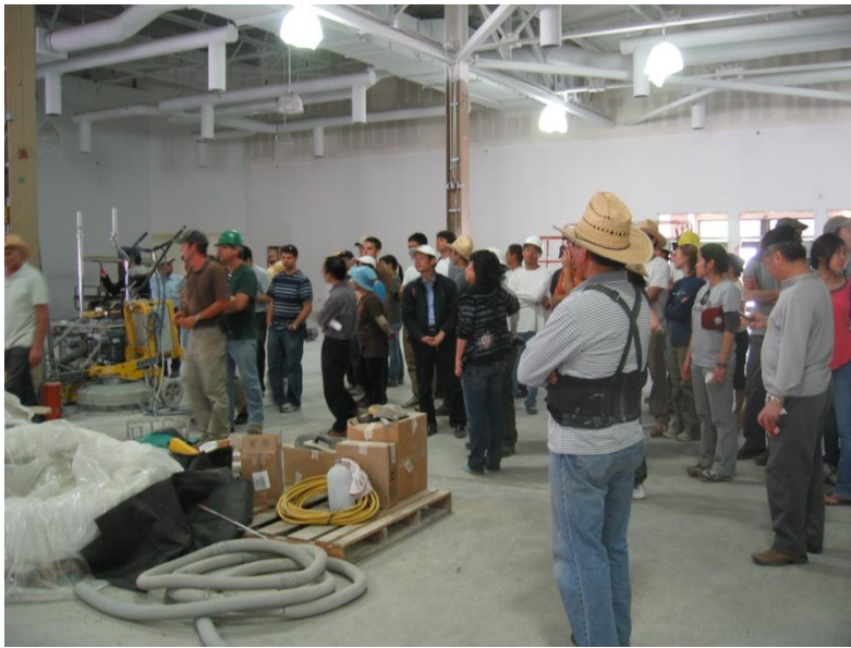
In the afternoon of the Lord's Day, we were given a tour.