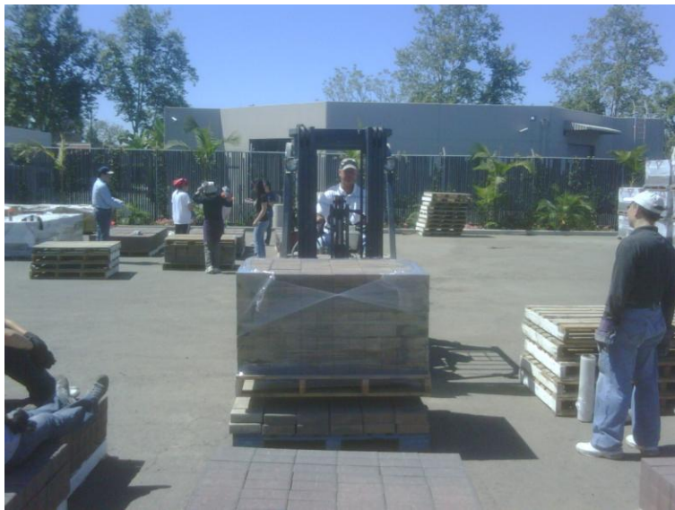
A new pallet is completed, wrapped ...